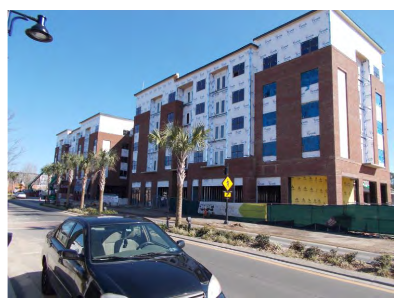
The Block under construction on Gaines Street.

5. Construction of the Riley House Visitor's Center. During FY 2013, CRA funds were used to complete the construction of The Riley House Visitor's Center, 413 East Jefferson Street, in the DT District. The 2,000 square foot visitor's center is an expansion of the John G. Riley Center/Museum for African American History & Culture, and is part of the museum's long-term plans to move administrative functions from the second floor of the museum and expand exhibit space, thereby improving the museum visitor's experience. The visitor center will house administrative functions on the second floor, with space on the ground floor designed to accommodate small conferences, artist presentations, lectures, book signings, catered events, and oral and visual history exhibits. Museum staff is also working to establish the Riley House Visitor's Center as a tourism hub to help promote year-round tourism opportunities in the community. Construction of the visitor's center began in January 2013 and was completed in June.