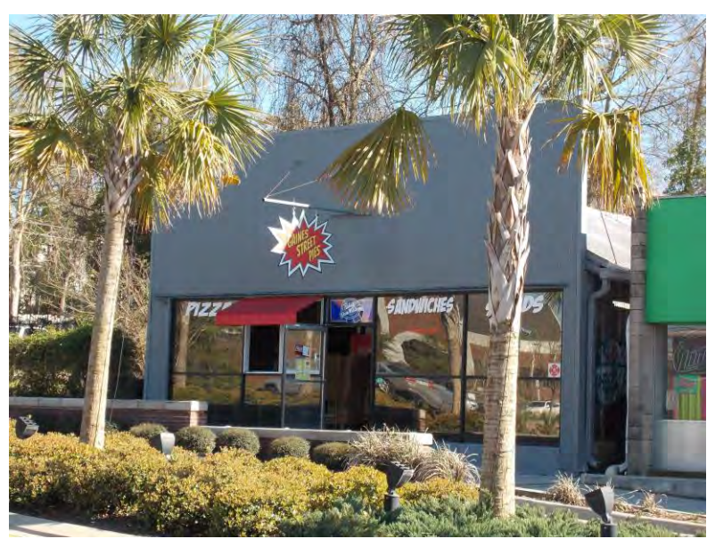
Gaines Street Pies opened in February 2013.

Gaines Street Pies, 507 West Gaines Street. In December 2012 Pizza Bros, LLC, d/b/a Gaines Street Pies, received a $10,000 retail incentives loan for interior improvements and the purchase of FFE for a pizza restaurant that would be located in a vacant retail building. The total estimated cost of the interior build out and FFE was $42,000. The CRA loan funds were supplemented with a cash investment by the restaurant partners and financed equipment. The applicants used only $9,007 of available loan funds. At the time of the application, the applicants estimated the restaurant would create six full-time jobs and three to six part-time jobs. Gaines Street Pies opened in February 2013 and has become one of several favorite eating places on Gaines Street.