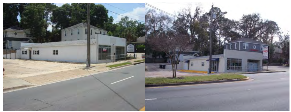
The Botel building before façade renovations (left) and after (right).

Botel Building, 523 East Tennessee Street. In July 2012, Robert and Tanya Botel received a commercial façade improvement grant of $28,155 for a variety of exterior improvements to the their building, including the application of a stucco covering to the existing concrete block exterior, installation of an overhead delivery door, installation of a new side entrance door, installation of a new glass storefront on Tennessee Street, new awnings and gutters, new exterior lighting, and the expansion of an existing concrete pad extending out from the east building. The cost of the exterior façade improvements was in excess of $60,000 and the total cost of exterior and anticipated interior renovations to the building was estimated at than $70,000, not including tenant improvements. The façade renovations were completed in November 2012.