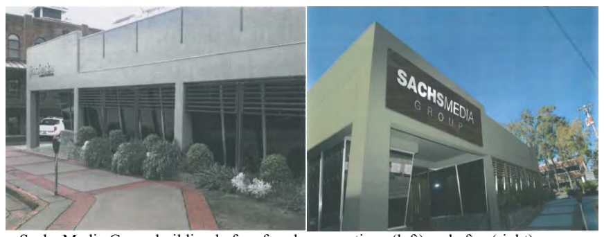
Sachs Media Group building before façade renovations (left) and after (right).

Sachs Media Group, 114 South Duval Street. In March 2013, Sea Moon Properties, LLC, received a commercial façade improvement grant of $8,489 for a new sign, re-staining of front louvers and wood doors to match the new sign, and repairs to the parapet on the front occupied by the Sachs Media Group, Inc. The low bid of qualified items for the exterior improvements was $16,979. During the renovations the applicant elected to omit the LED backlighting for the sign, which reduced the grant amount to $5,786.15. The exterior renovations were part of a larger interior renovation that will improve the functionality of the building. The total estimated cost of the exterior and interior improvements is $300,000. The façade improvements were completed in July 2013.