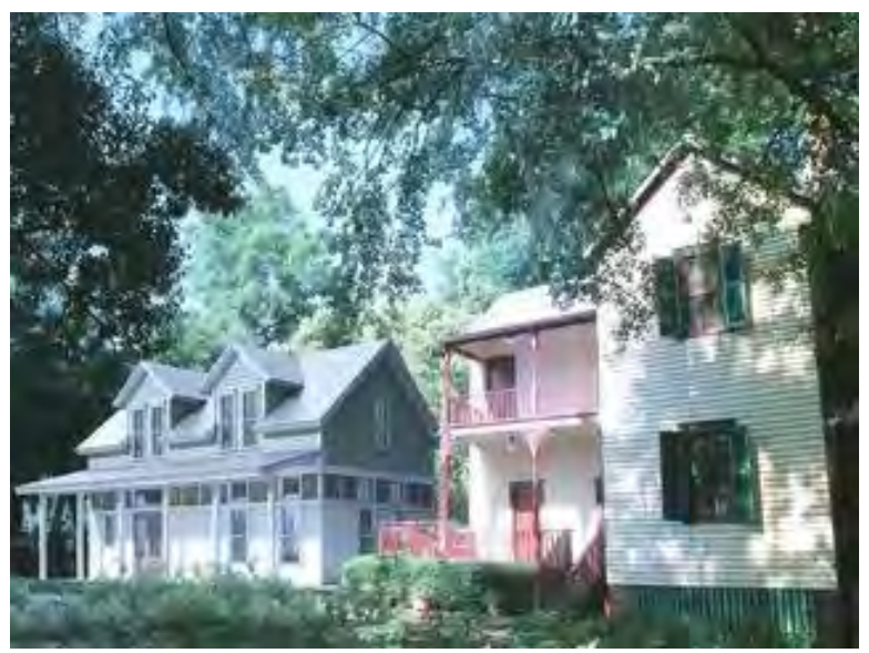
Riley House Visitor's Center (left) and the Riley House (right).

6. Completion of College Town, Phase 1. Located in the DT District, College Town is a mixed-used development with approximately 44,000 square-feet of retail space and 72 residential units located at the intersection of Madison Street and Woodward Avenue. The CRA funds were used to help with the costs of infrastructure improvements, including tap fees, undergrounding of overhead electrical lines, stormwater and streetscape improvements. Construction began in early 2012 and was completed in July 2013. The development will be added to the tax rolls in 2014, and will generate tax increment for the CRA starting in FY 2015. The development is projected to have a post-construction taxable value of $15.5 million, an increase of $14.3 million over the current taxable value. Plans are already underway for Phase 2 of College Town, with construction expected to start in the summer of 2014 for a summer or early fall 2015 opening date.