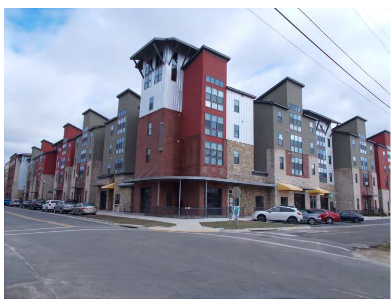
The completed Catalyst development from Madison Street.

8. Completion of 601 South Copeland. 601 South Copeland is a student housing development that consists of 81 apartments with 283 beds, a 5,000 square foot resident's community center, and a 5-story parking garage with 282 parking spaces. The CRA grant funds were used for roadway enhancements, streetscape and visual enhancements along the edges of the property, the relocation of overhead electric lines, and stormwater pond improvements. The development is located on a former vacant City utility drive-through payment center at the intersection of Macomb, Madison and St. Augustine Streets. Construction began in the summer of 2012 and was completed in September 2013. The development will be added to the tax rolls in 2014, and will generate tax increment for the CRA starting in FY 2015. The development is projected to have a post-construction taxable value of $11.5 million, an increase of $10.2 million over the current taxable value to the DT District.