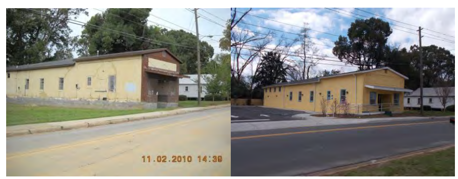
The NAACP's Franklin building before (left) and after (right) renovations.

Occupancy from the City of Tallahassee. The CRA funded renovations began in March 2013 and were completed in May. The NAACP was still working on interior and site improvements at the end of the fiscal year.