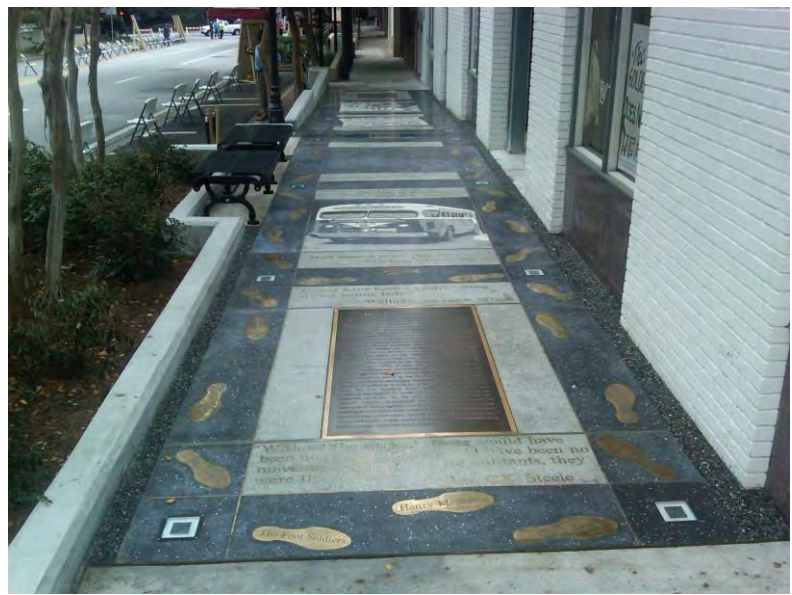
The sidewalk on Jefferson Street being prepared for panel installations (top), and the panels installed and ready for the Tallahassee-Leon County Civil Rights Heritage Walk dedication on September 30, 2013 (bottom).

2. Renovation of the Historic Franklin Building. During FY 2013 CRA funds were used by the Tallahassee Branch of the NAACP to assist in the renovation of the historic Franklin Building at 719 West Brevard Street, which is in the GFS District. The CRA and NAACP renovations will help renovate the building as the local NAACP headquarters, establish a NAACP Civil Rights Museum and provide community meeting space. The CRA funds were used for extensive exterior renovations, including a new roof, windows, doors, siding and paint; as well as basic interior renovations needed for the project to receive a Certificate of