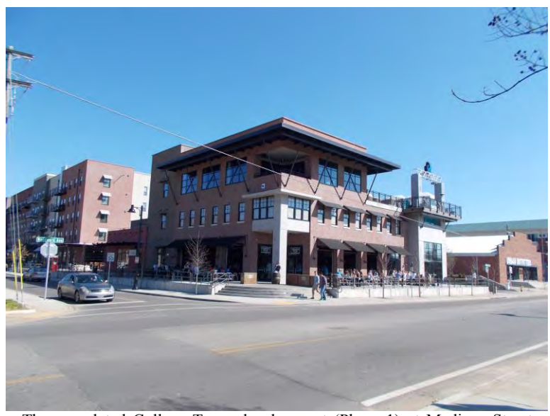
The completed College Town development (Phase 1) at Madison Street and Woodward Avenue.

7. Completion of the Catalyst. The Catalyst is a mixed-use apartment development with 128 apartments, 400 beds, 3,650 square feet of retail, and a 5-story parking garage with 381 parking spaces. The development is located on the former Ro Mac Lumber site on Madison Street. The CRA grant funds were used to provide 16 public parking spaces in the garage, 24 on-street public parking spaces, ground-floor retail space treatments, and enhanced streetscape/pedestrian treatments. Construction began in the summer of 2012 and was completed in September 2013. The development will be added to the tax rolls in 2014, and will generate tax increment for the CRA starting in FY 2015. The development is projected to have a post-construction taxable value of $14.4 million, an increase of $13.5 million over the current taxable value to the DT District.