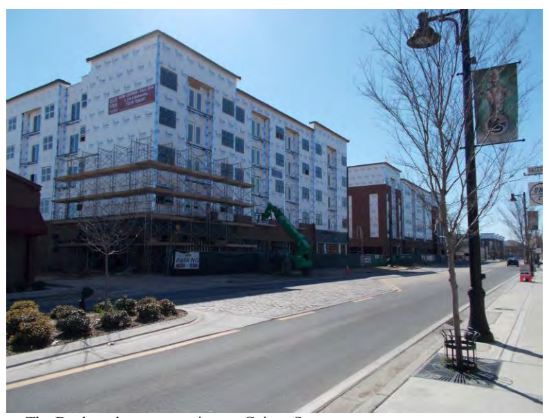
The Deck under construction on Gaines Street.