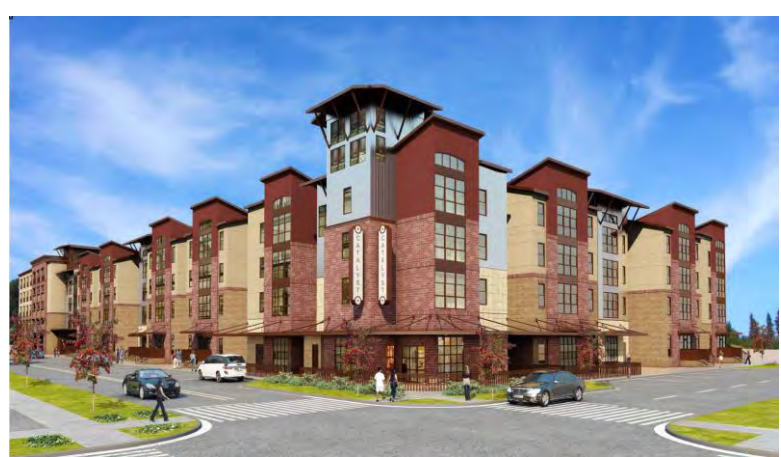
A rendering of the proposed Catalyst development Madison Street.

7. Completion of the Catalyst. The Catalyst is a mixed-use apartment development with 128 apartments, 400 beds, 3,650 square feet of retail, and a 5-story parking garage with 381 parking spaces. The development is located on the former Ro Mac Lumber site on Madison Street. The CRA grant funds were used to provide 16 public parking spaces in the garage, 24 on-street public parking spaces, ground-floor retail space treatments, and enhanced streetscape/pedestrian treatments. Construction began in the summer of 2012 and was completed in September 2013. The development will be added to the tax rolls in 2014, and will generate tax increment for the CRA starting in FY 2015. The development is projected to have a post-construction taxable value of $14.4 million, an increase of $13.5 million over the current taxable value to the DT District.