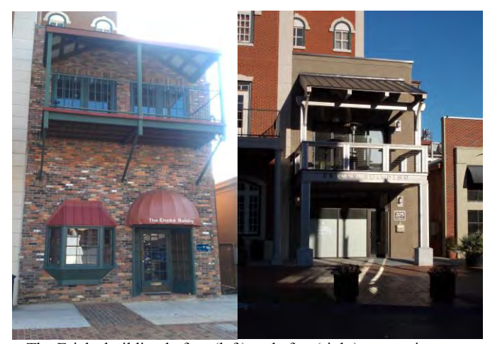
The Ericks building before (left) and after (right) renovations.

Sachs Media Group, 114 South Duval Street. In March 2013, Sea Moon Properties, LLC, received a commercial façade improvement grant of $8,489 for a new sign, re-staining of front louvers and wood doors to match the new sign, and repairs to the parapet on the front occupied by the Sachs Media Group, Inc. The low bid of qualified items for the exterior improvements was $16,979. During the renovations the applicant elected to omit the LED backlighting for the sign, which reduced the grant amount to $5,786.15. The exterior renovations were part of a larger interior renovation that will improve the functionality of the building. The total estimated cost of the exterior and interior improvements is $300,000. The façade improvements were completed in July 2013.