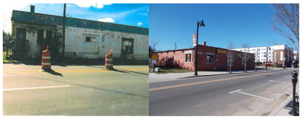
The Franklin Worth building before façade renovations (left) and after (right).

Franklin Worth Building, 729 West Gaines Street. In July 2012, the Franklin Worth Trust received a commercial façade grant of $24,779 for a variety of exterior improvements, including removal of paint from the brick façade; repairs to the brick façade; the installation of new windows, doorway, and entrance deck on the north side of the building; the installation of awnings on the west side of the building; the replacement of a garage door on the south side of the building with French doors; and the construction of wooden railings around the existing concrete deck on the south side. The cost of the exterior façade improvements was in excess of $50,000 and the total cost of exterior and anticipated interior renovations to the building was estimated at more than $100,000. The façade renovations were completed in February 2013.