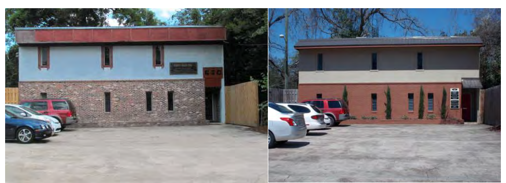
The Beasley building before façade renovations (left) and after (right).

Beasley Building, 630 West Brevard Street. In January 2013, Stephen Beasley received a commercial façade improvement grant of $8,950 for exterior improvements to his building that included the replacement of the entry door, improved lighting, adding trim to the windows, adding stucco to the front of the second story, staining the brick front, and replacing the existing roofline with a decorative metal overhang. The renovations were completed in May 2013.