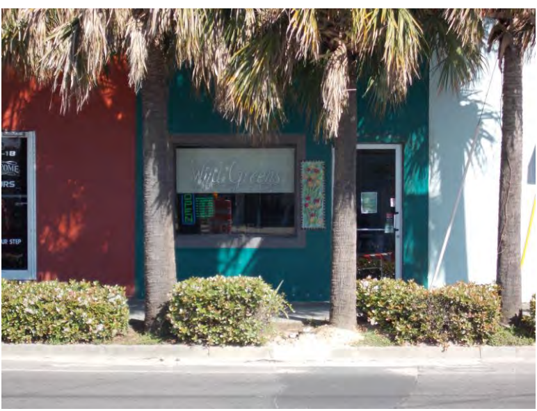
Wild Greens Café shortly after its opening in November 2012.

Wild Greens Café, 915-2 Railroad Avenue. In August 2012 Lia C. Chasar, LLC, d/b/a Wild Greens Café, received a $9,800 retail incentives loan for interior improvements and the purchase of furnishings, fixtures and equipment (FFE) for a vegetarian restaurant located in the Bread & Roses Food Cooperative on Railroad Avenue. The total estimated cost of the interior build out and FFE was $97,550. The CRA loan funds were supplemented with a cash investment and FFE already owned by the applicant. Renovations began in September 2012 and the restaurant opened in November 2012. Unfortunately, the applicant filed for bankruptcy in October 2013. CRA staff was able to recover approximately $6,100 of the outstanding loan balance through the sale of collateralized restaurant FFE.