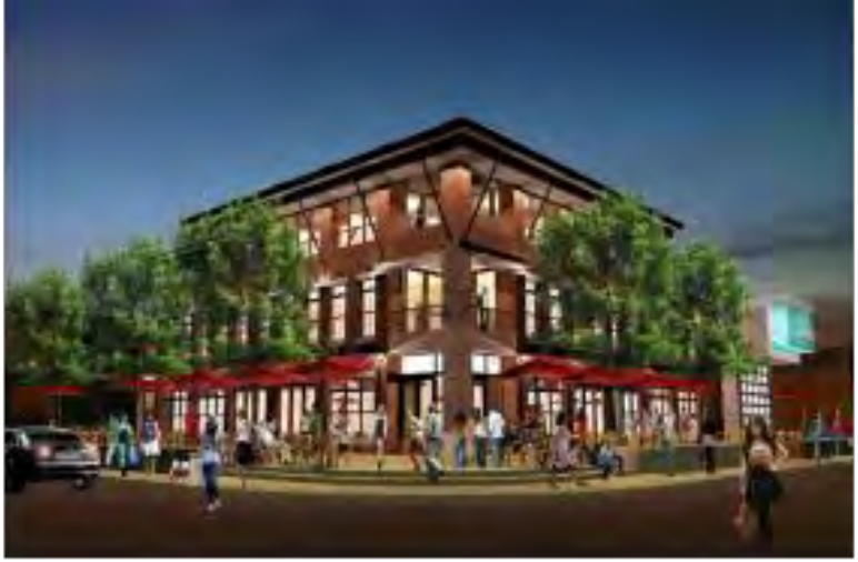
Rendering of College Town at Madison Street and Woodward Avenue.

6. Completion of College Town, Phase 1. Located in the DT District, College Town is a mixed-used development with approximately 44,000 square-feet of retail space and 72 residential units located at the intersection of Madison Street and Woodward Avenue. The CRA funds were used to help with the costs of infrastructure improvements, including tap fees, undergrounding of overhead electrical lines, stormwater and streetscape improvements. Construction began in early 2012 and was completed in July 2013. The development will be added to the tax rolls in 2014, and will generate tax increment for the CRA starting in FY 2015. The development is projected to have a post-construction taxable value of $15.5 million, an increase of $14.3 million over the current taxable value. Plans are already underway for Phase 2 of College Town, with construction expected to start in the summer of 2014 for a summer or early fall 2015 opening date.