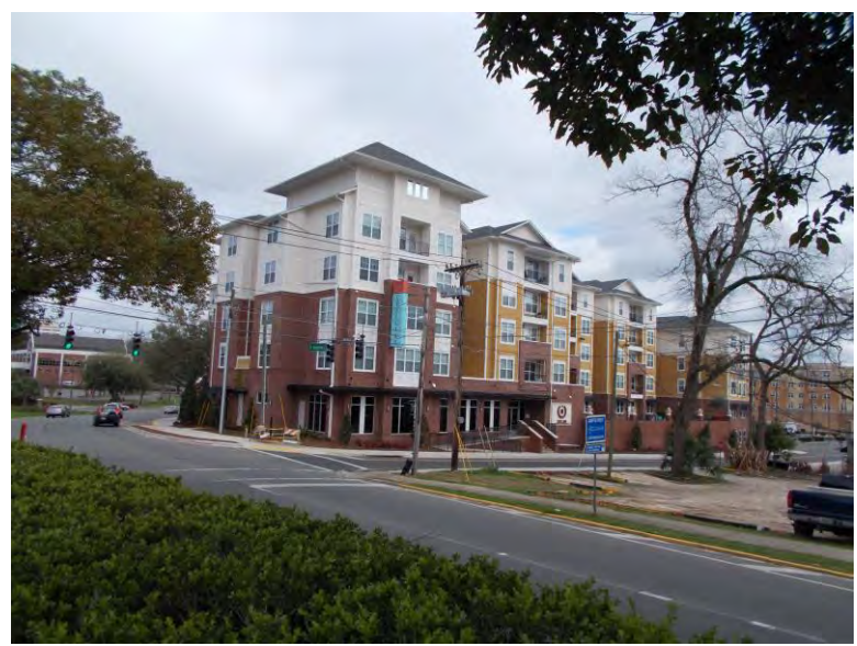
The completed 601 South Copeland from St. Augustine Street.

9. <u>Promotional and Special Events</u>. During the fiscal year, the CRA helped sponsor eighteen (18) promotional and special events in the GFS and DT redevelopment districts. A brief summary of each event by district is provided below.