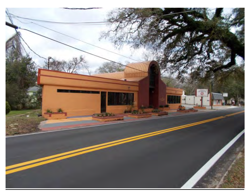
The Tallahassee Urban League building following renovations

3. Renovation of the Tallahassee Urban League Building. During FY 2013 CRA funds were used to assist the Tallahassee Urban League with a major renovation of their building at 923 Old Bainbridge Road, which is in the GFS District. The CRA supported improvements included the installation of a metal roof over a former glass dome, upgrade to the HVAC system, stucco repair, installation of new windows and an entrance door, and exterior painting. The renovations also included extensive interior renovations completed by the Urban League.