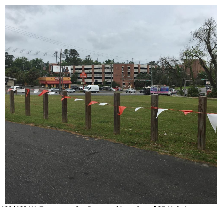
466/468 W. Tennessee St - Proposed Location of 87-Unit Apartment

<u>Phase III</u> - The grocery store originally planned for the CRA properties at 466 and 468 W. Tennessee Street will be replaced with an 87-unit apartment with 63 1-bedroom, 21 2-bedroom and 3 3-bedroom units. Seventeen of the apartments would be designated at affordable. A variety of fresh food options are being considered for the ground-floor.