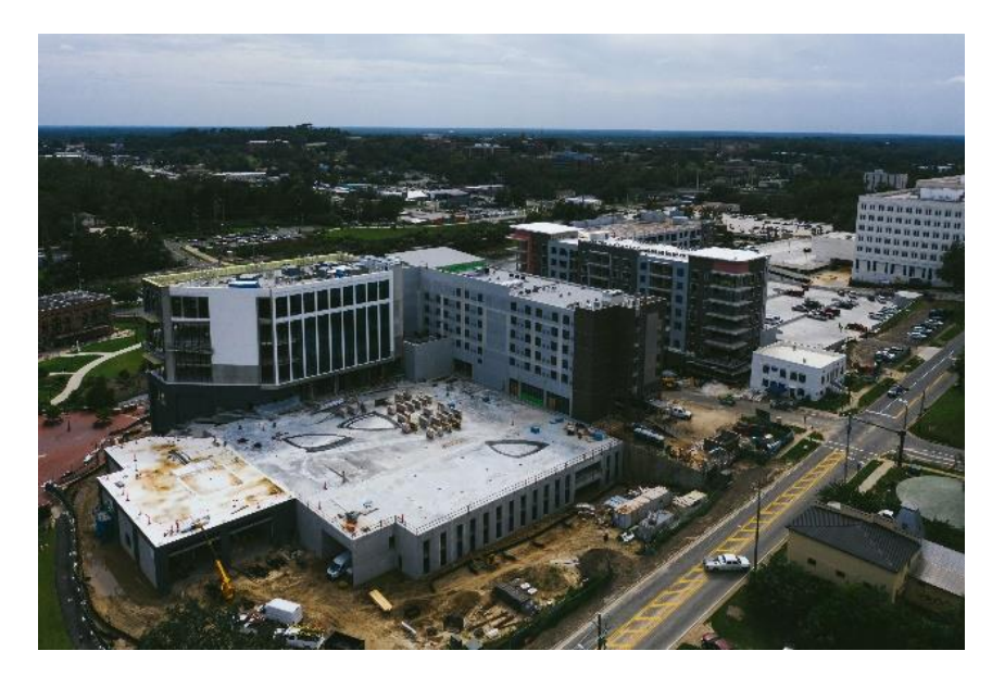
Cascades Project Site, September 2020

the project. It is expected the building will be available for lease or purchase when the development is complete. The entire project is projected to add $150 million in new taxable value when added to the DT District tax rolls in 2021 and/or 2022. Under the agreement with the CRA, CJV will receive 90 percent of the tax increment generated by the development until the district sunsets in FY 2034.