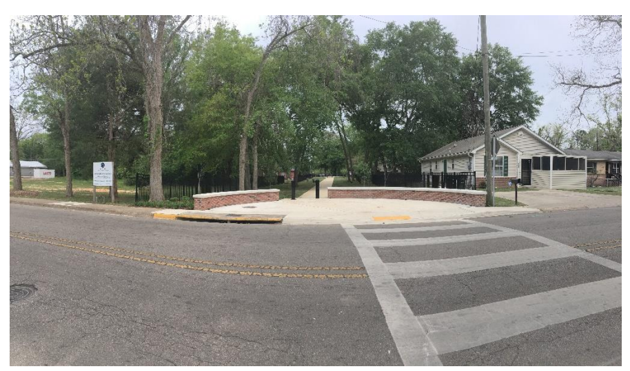
Greater Bond Linear Park Entrance